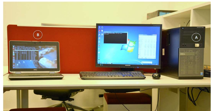
Figure 1. Illustration of USBee. An ordinary, unmodified USB device (flash drive) (A) is transmitting information to a nearby receiver (B) over an air-gap, via electromagnetic waves emitted from its data bus.

to a computer [3]. Hardware based USB keyloggers which include internal radio or Wi-Fi transmitters also exist [4]. However, all of the aforementioned tools require hardware modification of the USB plugs (embedding an RF transmitter or receiver within them). In this paper we show how to leak data from an air-gapped computer over RF signals to a receiver located a short distance away using an unmodified USB dongle. We introduce USBee, a malware which utilizes the USB data bus in order to create electromagnetic emissions from a connected USB device. USBee can modulate any binary data over the electromagnetic waves and transmit it to a nearby receiver. The attack scenario is illustrated in Figure 1.